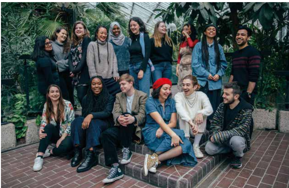
2018/19 Barbican Young Programmers, Barbican Conservatory.

open submission shorts programme and a showcase of British archive films. Following the festival, alumni from the 2018/19 cohort were invited to take part in programming future Barbican Cinema activity, including events within Sheffield DocFest and Leytonstone Loves Film, which will take place during the following year.