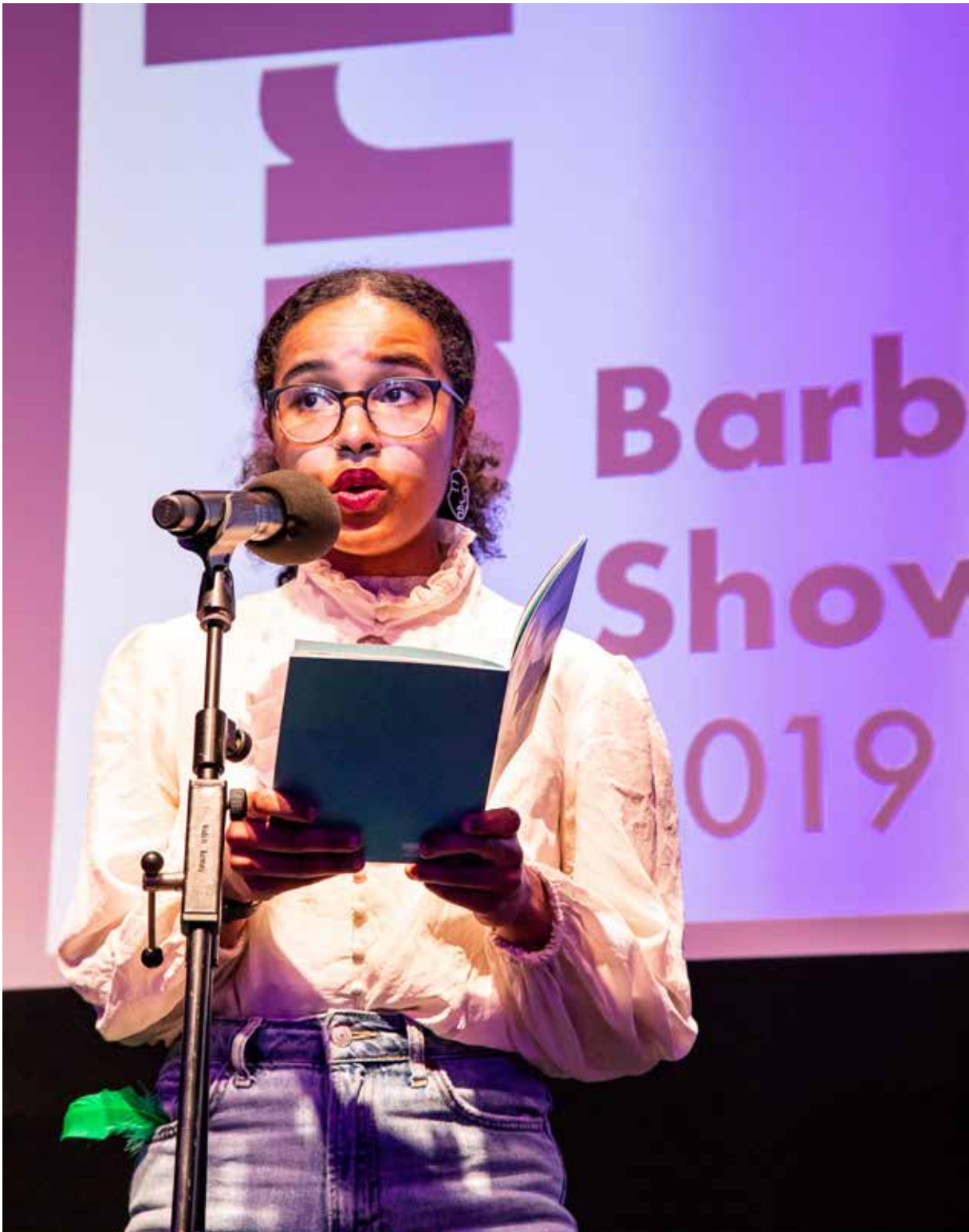
Barbican Young Poets member performs in the Barbican Young Poets 2018/19 Showcase.

The Barbican Centre Trust continues to support the Barbican's mission to inspire more people to discover and love the arts. 1,059,000 people attended Barbican events in 2018/19, with donations and grants raised through the Trust contributing to several audience development initiatives.