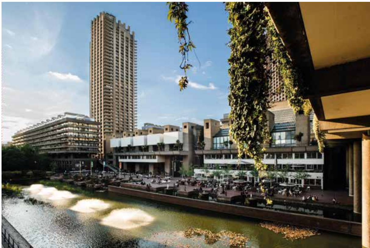
Lakeside Terrace, Barbican Centre.