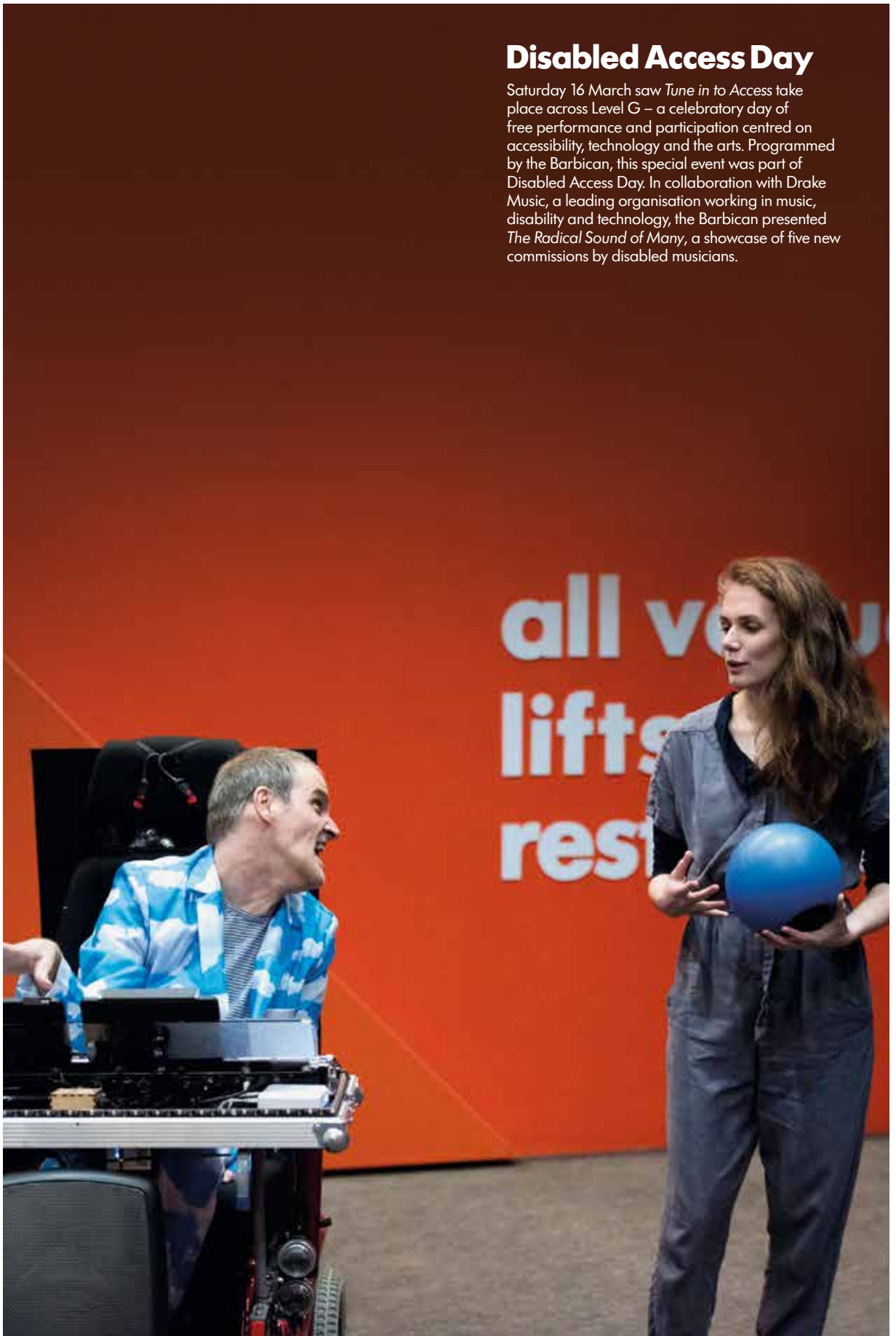
Tune in to Access on Level G of the Barbican Centre, March 2019

Saturday 16 March saw Tune in to Access take place across Level G – a celebratory day of free performance and participation centred on accessibility, technology and the arts. Programmed by the Barbican, this special event was part of Disabled Access Day. In collaboration with Drake Music, a leading organisation working in music, disability and technology, the Barbican presented The Radical Sound of Many , a showcase of five new commissions by disabled musicians.