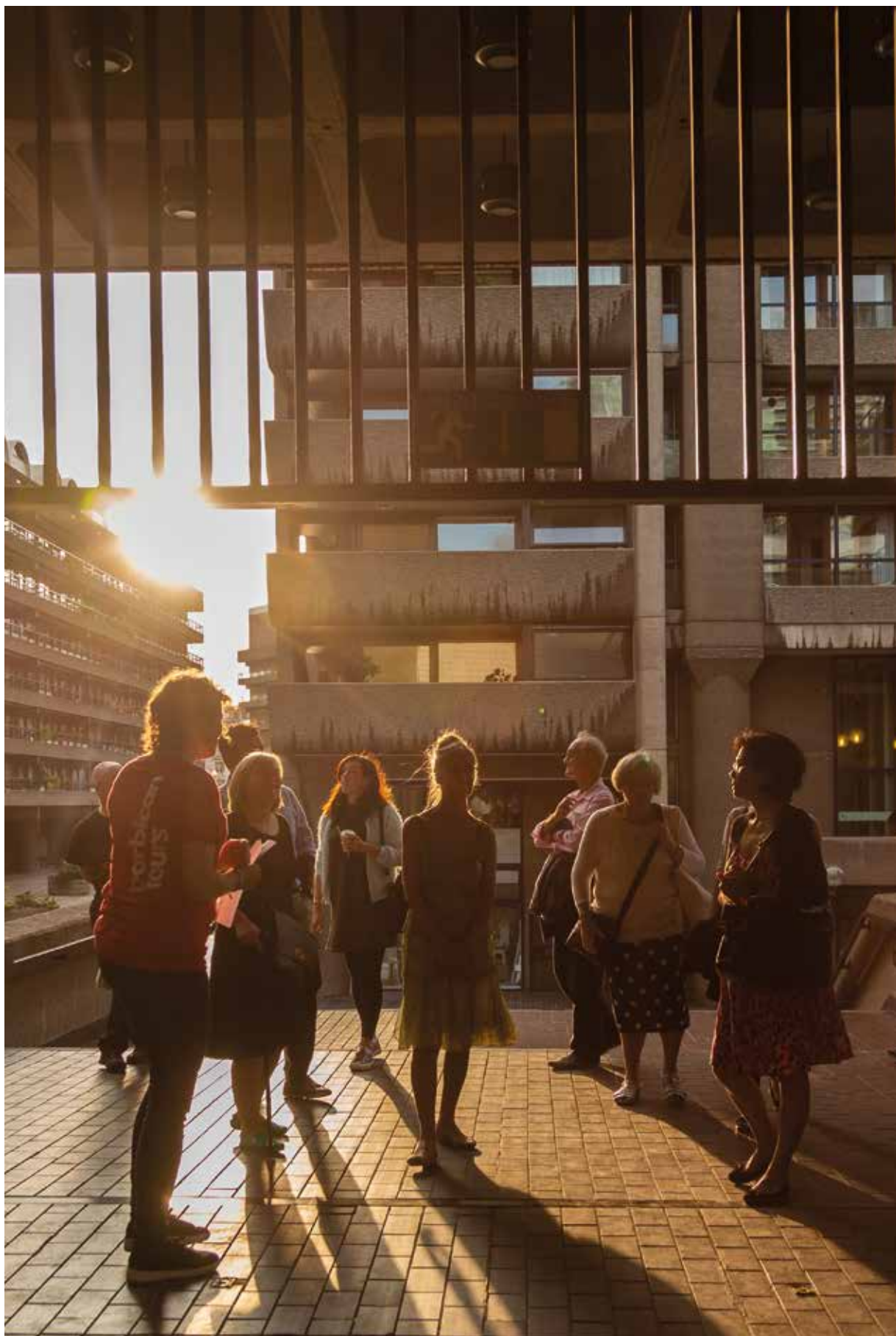
Community View participants enjoy an architecture tour of the Barbican.