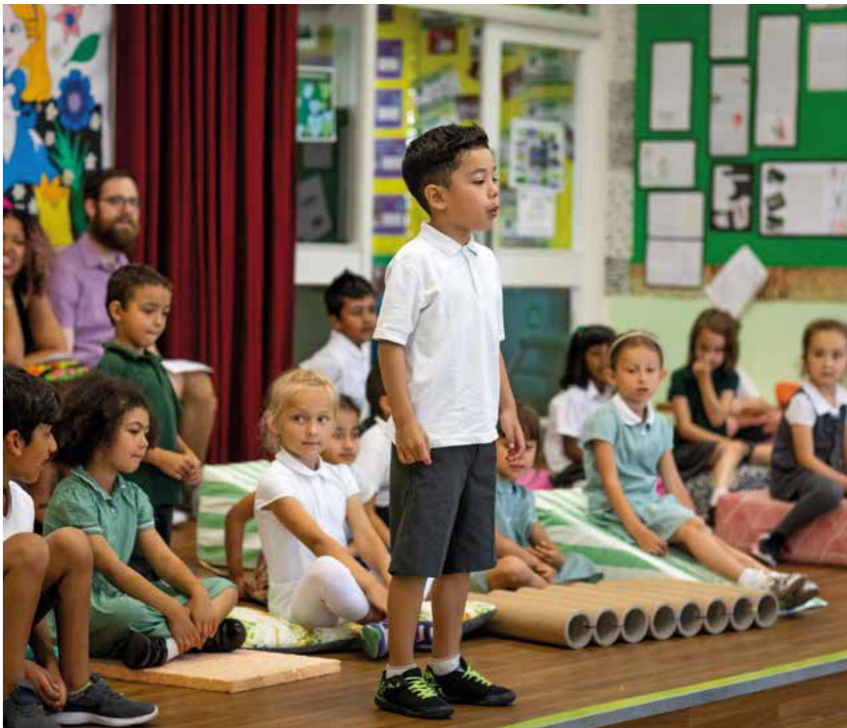
Poetry workshop at Associate School Greenleaf Primary.