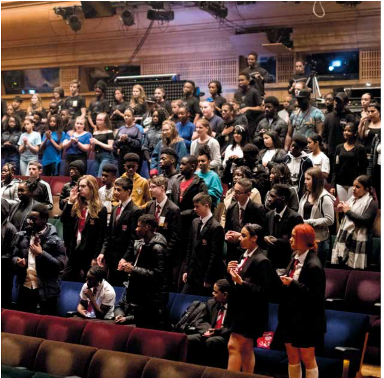
Students from Arts & Media School Islington prepare for their Music Showcase at the Barbican.

Here are highlights of some of the programmes and projects made possible by supporters and partners this year.