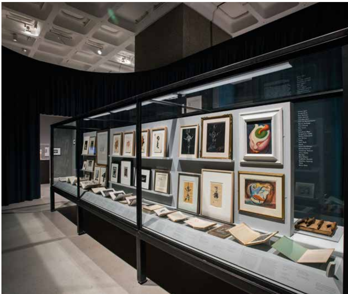
Installation view of Modern Couples: Art, Intimacy and the Avant-Garde , Barbican Art Gallery.