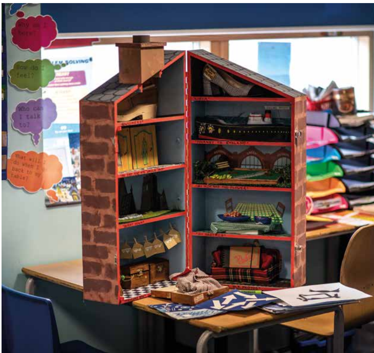
2018/19 Barbican Primary Box, curated by author Michael Rosen for use in art, music and theatre workshops around themes of 'home' and 'family'.

Invaluable funding from the Esmée Fairbairn Foundation has enabled Creative Learning to begin work on a three-year schools programme to be delivered nationally, reaching young people in hard-to-reach communities. The aim of this innovative programme is to support stronger relationships between local arts centres and schools, enhance access and participation in the arts for young people who have limited access, and support teachers and artists to innovate classroom practice.