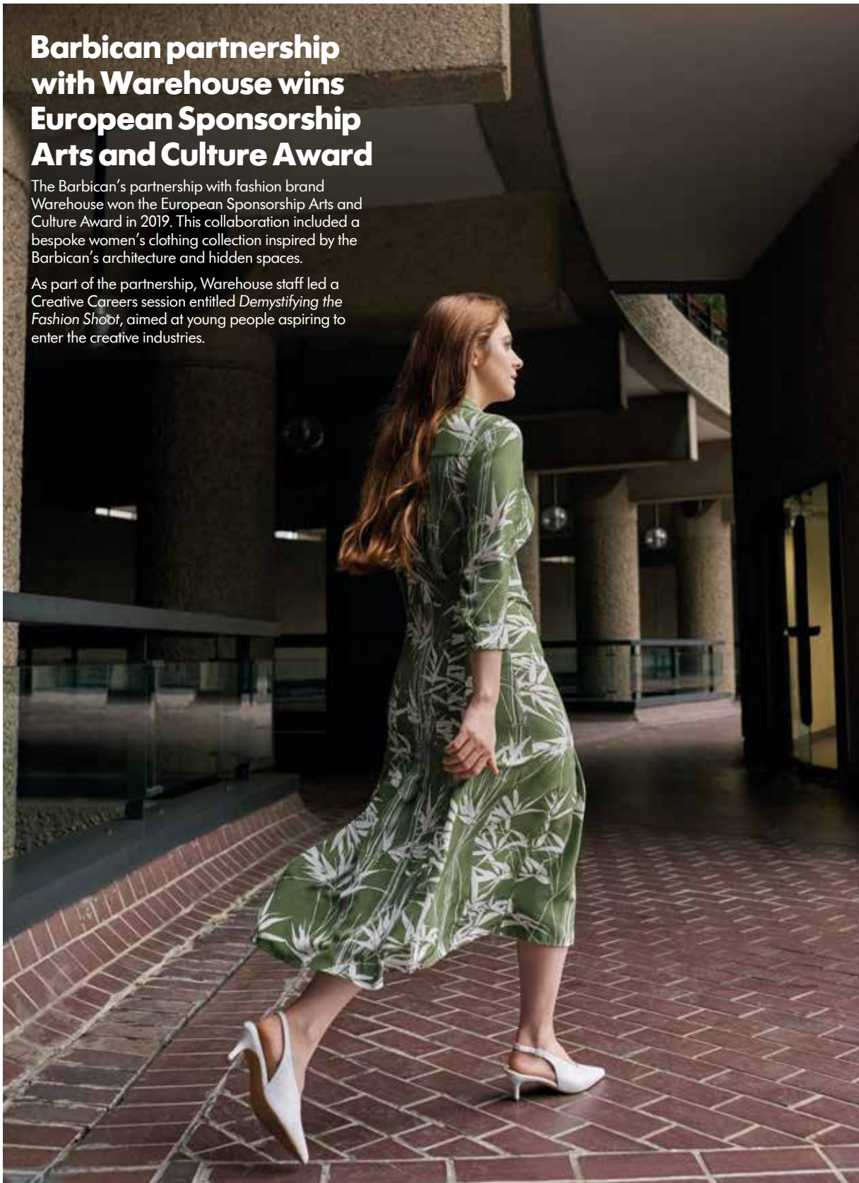
Warehouse X Barbican: Inside Out photoshoot, Barbican Centre.

As part of the partnership, Warehouse staff led a Creative Careers session entitled Demystifying the Fashion Shoot , aimed at young people aspiring to enter the creative industries.