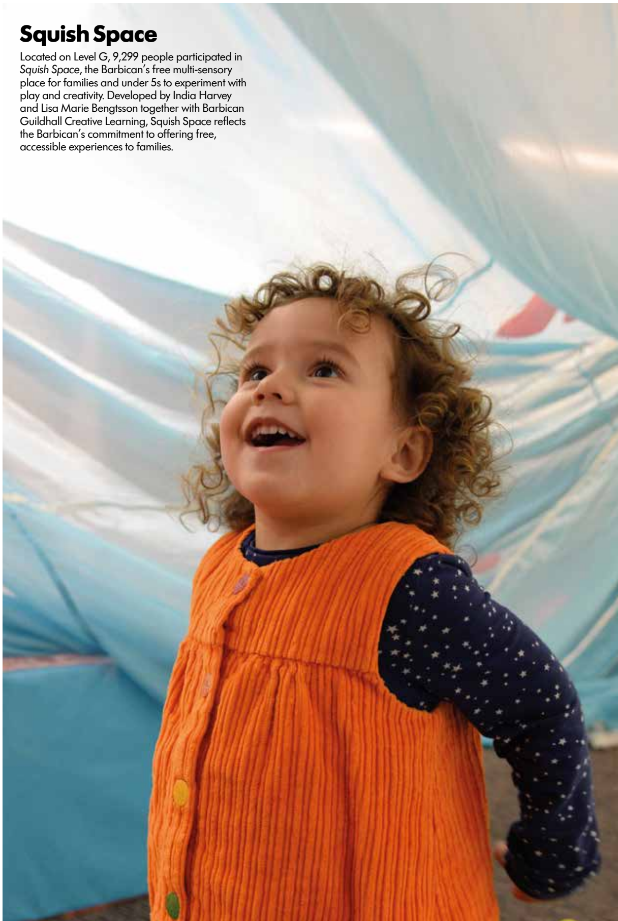
Squish Space, Level G, Barbican Centre.