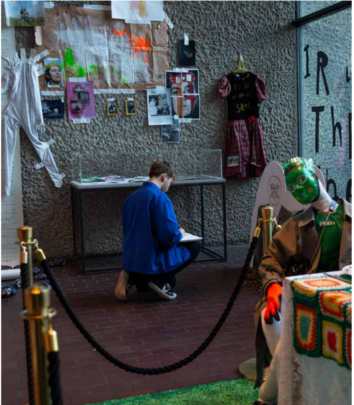
Installation view of 2018/19 Young Curators' Showcase, Barbican Centre.