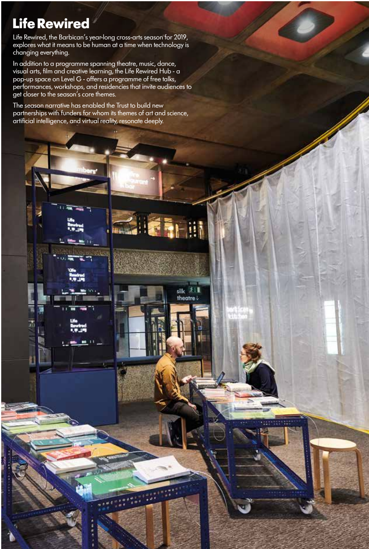
The Life Rewired Hub, Level G, Barbican Centre.

The season narrative has enabled the Trust to build new partnerships with funders for whom its themes of art and science, artificial intelligence, and virtual reality, resonate deeply.