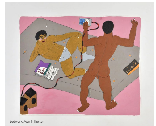
Bedwork, Men in the sun