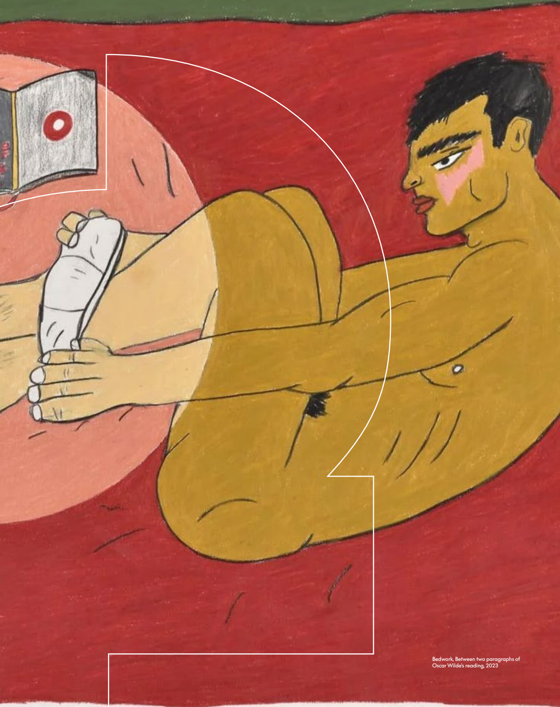
Bedwork, Between two paragraphs of Oscar Wilde's reading, 2023